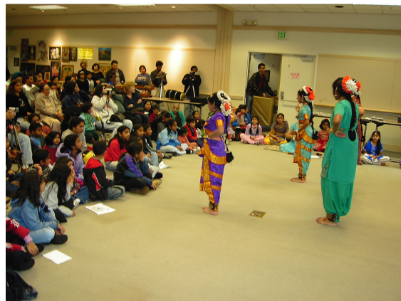
Glimpses of India-2004 (Fremont)