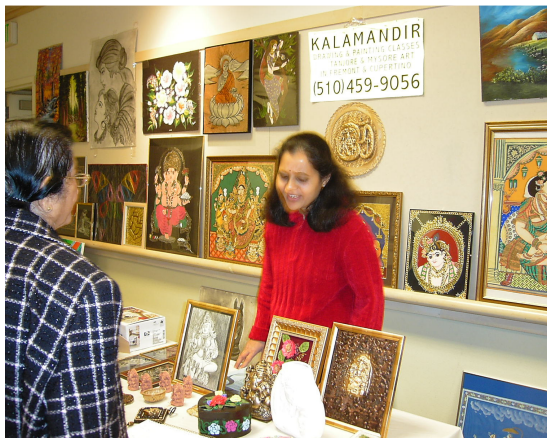
Glimpses of India- 2004

Exhibits, Cultural Program, Information Sunday, May 22, 2005 2pm – 4pm @SANTA CLARA LIBRARY @Homestead/Kiely